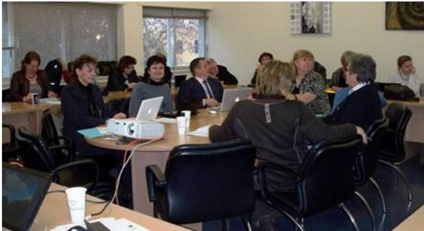
Working hard to define future tasks