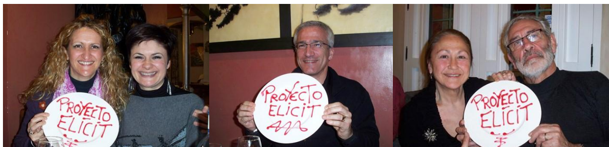
Dinner plates decorated in honour of the ELICIT project!