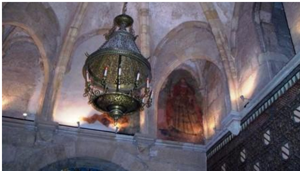
Chapel of the faculty of Philosophy