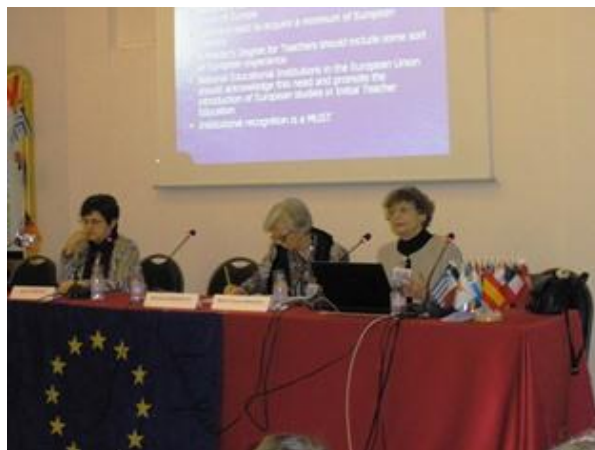
Hungarian, Italian and French speakers at the November 2010 seminar in Paris