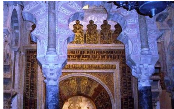
Inside the Mosque